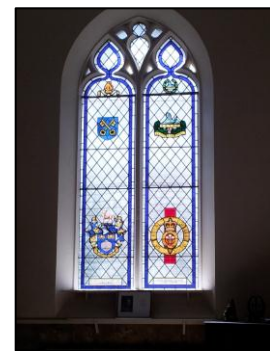
Ivor Gurney Window

Captain Robert Nairac – the 29 year old Grenadier Guardsman who was awarded the George Cross, posthumously, for outstanding bravery. Installed thanks to the Glos. Branch of the Royal Society of St George and dedicated on 6th May 2000