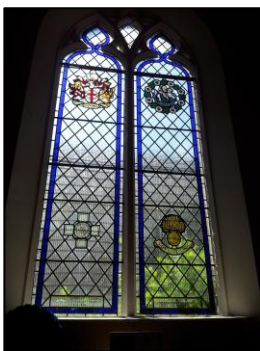
Robert Nairac Window

Captain Robert Nairac – the 29 year old Grenadier Guardsman who was awarded the George Cross, posthumously, for outstanding bravery. Installed thanks to the Glos. Branch of the Royal Society of St George and dedicated on 6th May 2000