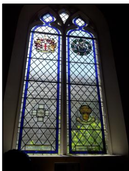
Robert Nairac Window