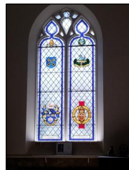
Ivor Gurney Window